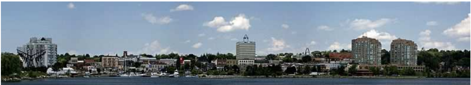
Barrie across Kempenfelt Bay, Lake Simcoe, Ontario