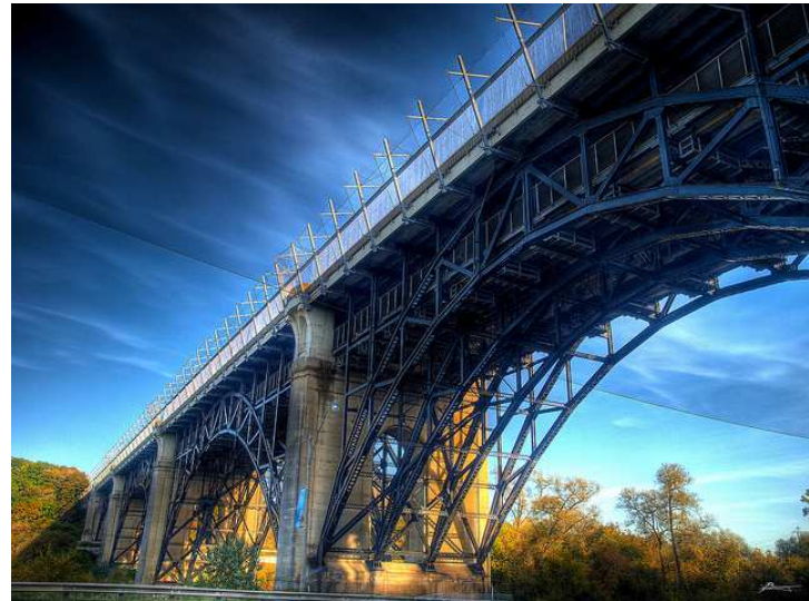
Bloor Viaduct, Don Valley, Toronto