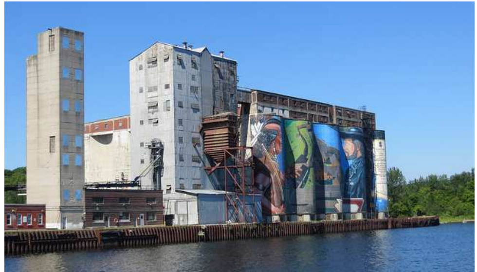
Archer Daniels Midland