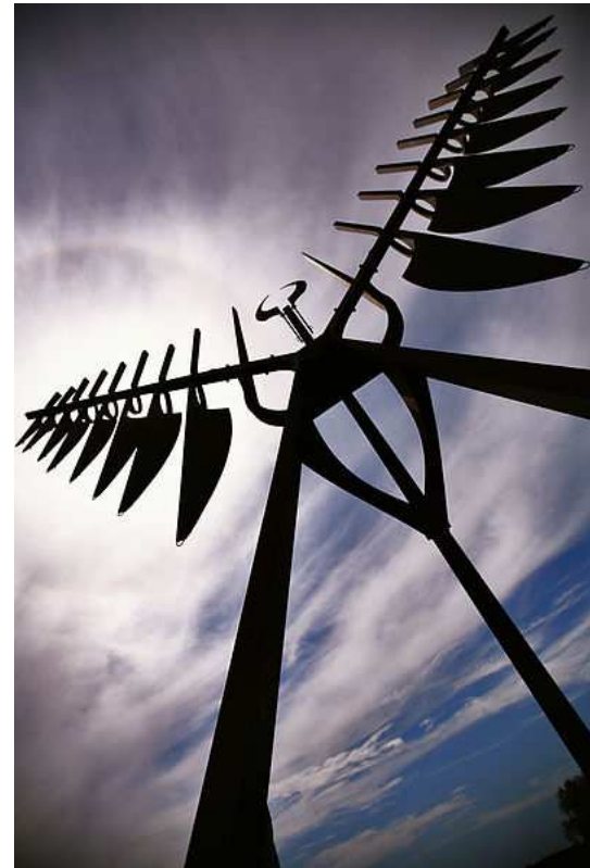
Spiritcatcher by Ron Baird (1986) in Barrie