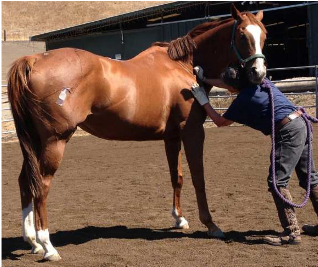
Cynthia Livingston's OTTB "Bedifferent"