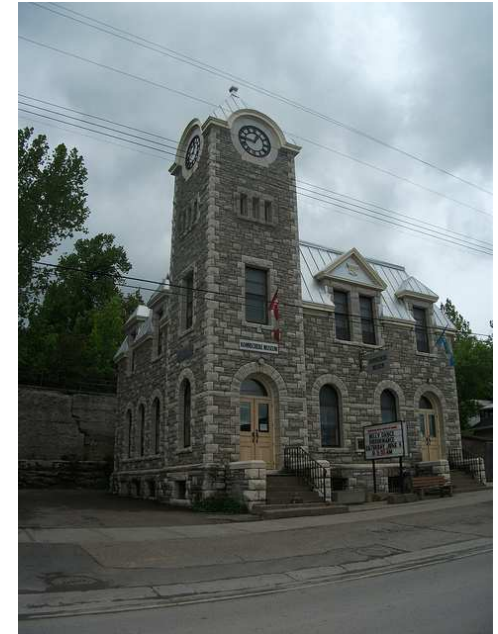
Bonnechere Museum, Eganville