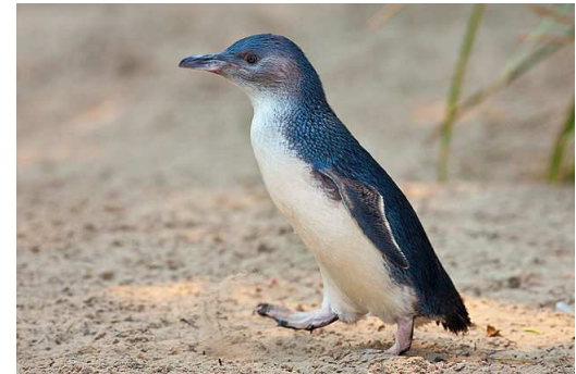
Little Blue Penguin