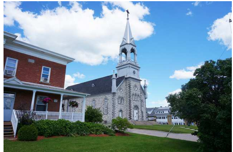
Paroisse Sainte Cécile de Masham, Quebec