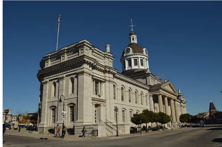
Kingston City Hall

All released with pod2mdoc-0.2 on May 19, 2015.