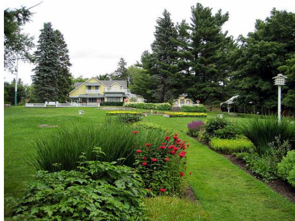
Moorside Cottage, Mackenzie King Estate, Gatineau Park