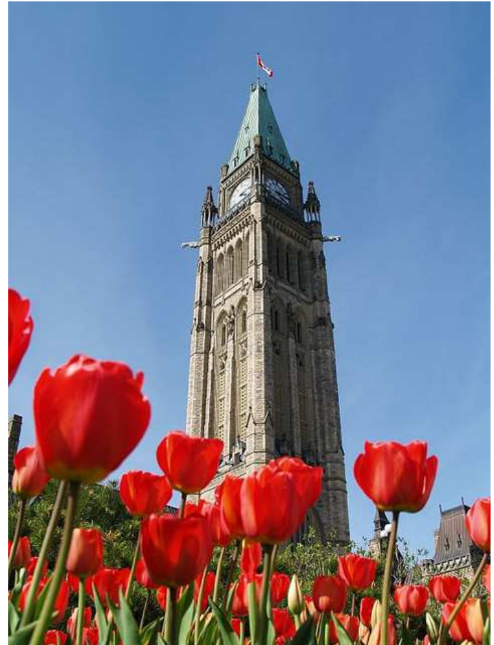
Tulip Festival, Peace Tower, Ottawa