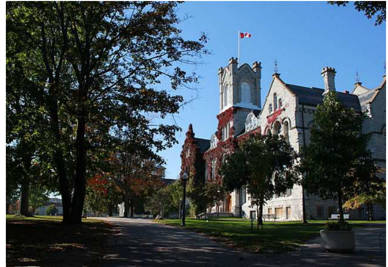
Theological Hall, Queen's University, Kingston

Such polishing may seem minor but is actually important: