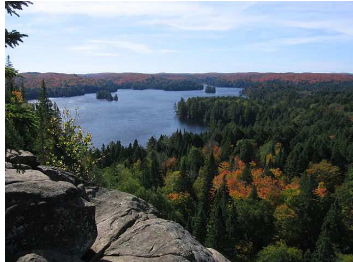
Cache Lake, Algonquin Park