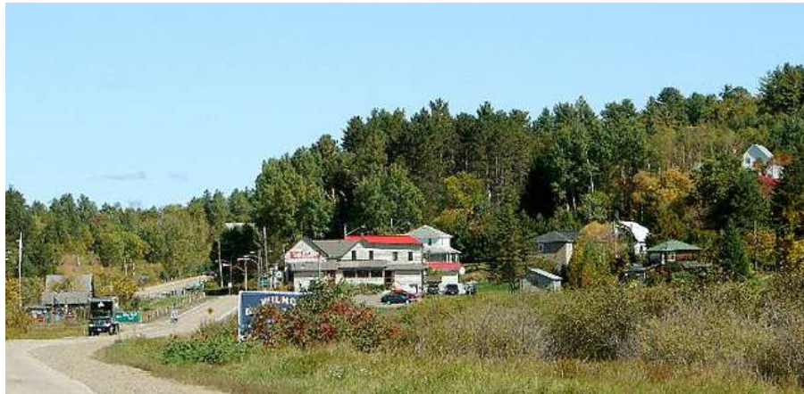
Wilno, Renfrew County, Ontario

Very easy to use, needs almost no learning