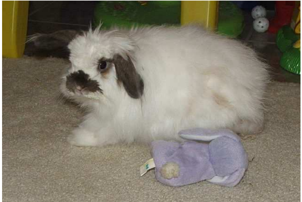
American Fuzzy Lop

For mandoc, full functional coverage requires running afl continuously for several days on modern PC hardware.