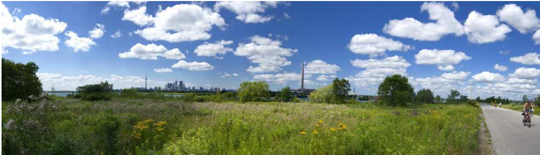
Tommy Thompson Park Toronto, Ontario