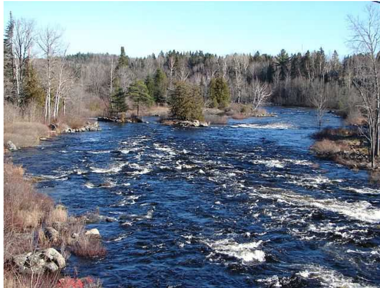
Madawaska River at Whitney

So far, there is no noticeable demand -> KISS.