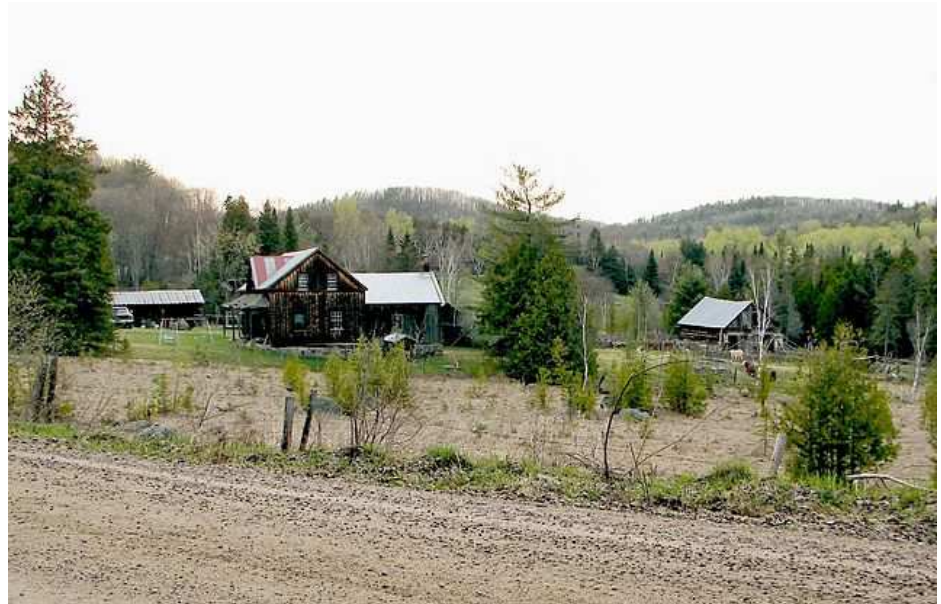
Opeongo Road, historic colonization road

After installing new manuals, makewhatis(8) is required for full database support. However, pkg_add(1) does that automatically and man(1) works even without it.