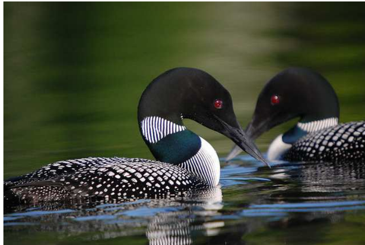
Common Loons