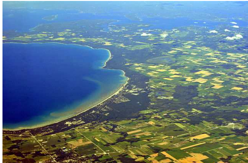
Wasaga Beach, L. Huron