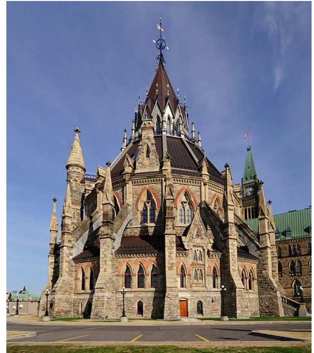
Library of Parliament, Ottawa