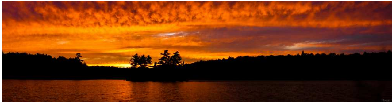
Maggie Lake Algonquin Park