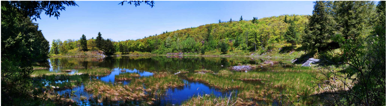
Black Lake near King Mountain, Gatineau Park, Quebec