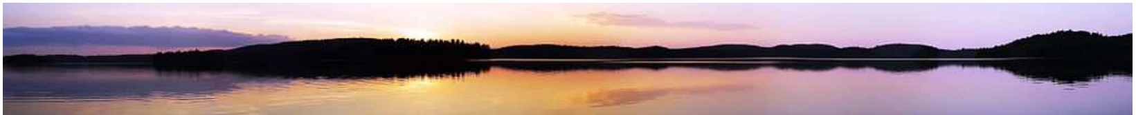
North Tea Lake, Algonquin Provincial Park